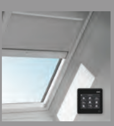
VELUX Blockout blind

Both blinds are installed in a matter of minutes with VELUX unique Pick&Click® system. There is no price difference between the two blinds either. Your choice is a matter of personal preference only.